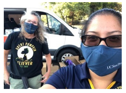
We really look forward to seeing all of you in person come August! Stay safe and healthy!

Any questions, please reach out via email, <u>librarians@preuss.ucsd.edu</u>